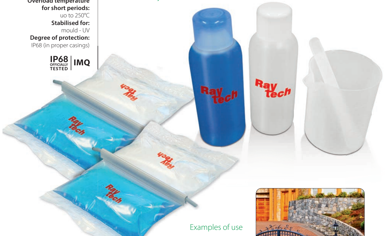
Examples of use