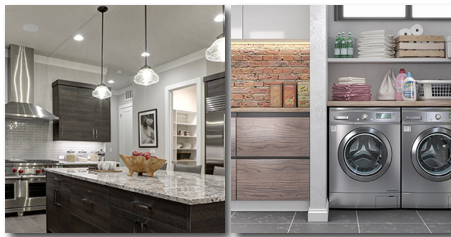
Laundry machine control