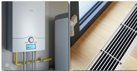
Water heater automation